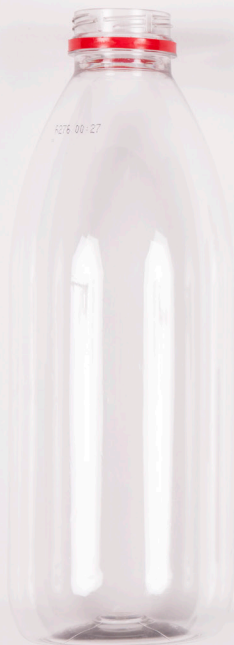
A plastic bottle