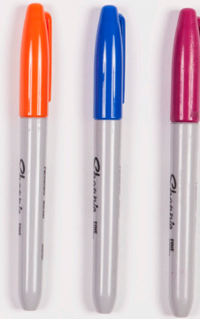
A marker pen